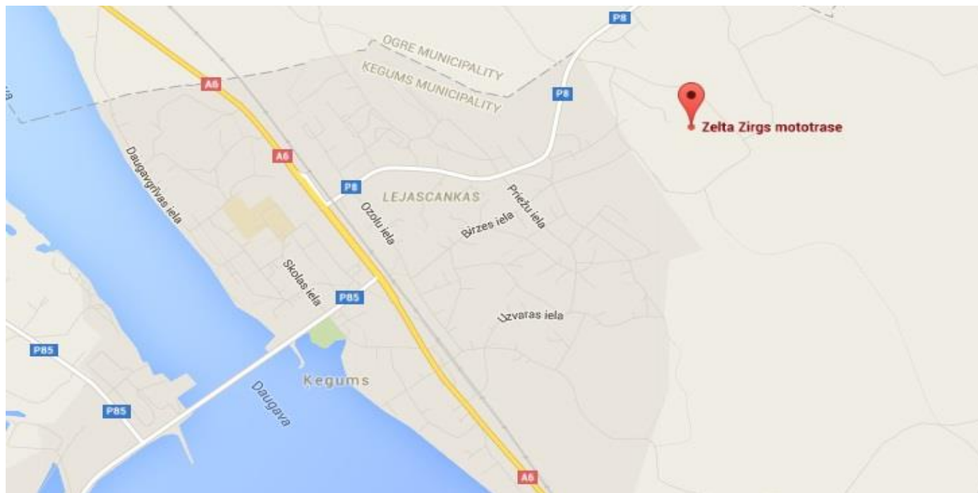
Map of the track